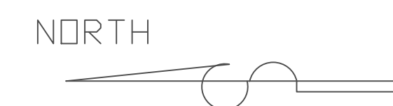
Plot Plan scale: 1" = 10'-0"